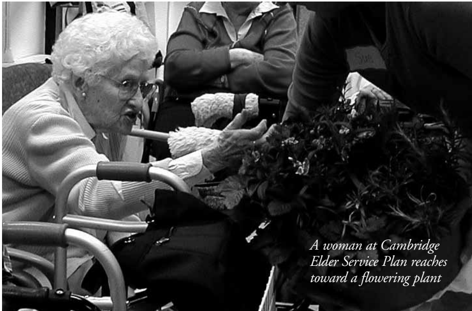
A woman at Cambridge Elder Service Plan reaches toward a flowering plant