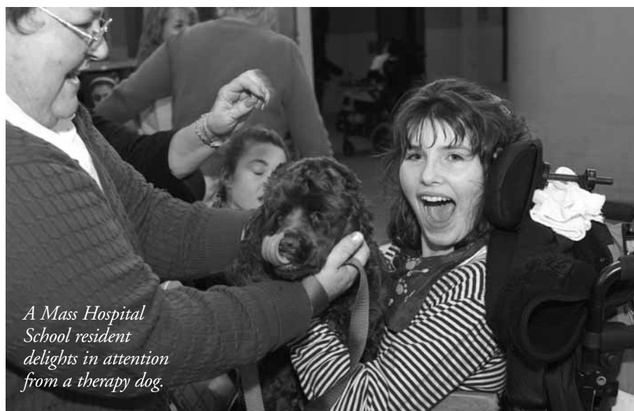
A Mass Hospital School resident delights in attention from a therapy dog.